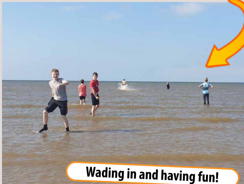
Wading in and having fun!

An enjoyable day at Lytham beach was had by some of our Key Stage 4 pupils, where they played a game of football and swam in the sea! KS4 also took some time out to complete mindful colouring and created some wonderful pieces of work.