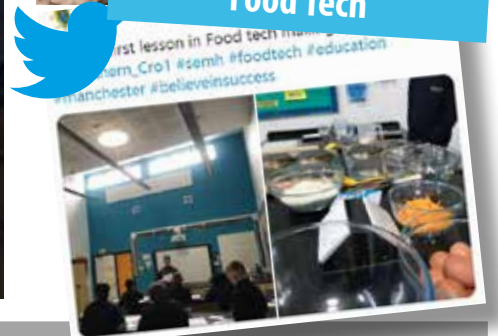
First lesson in Food tech making... #semh #foodtech #education #manchester #believeinsuccess