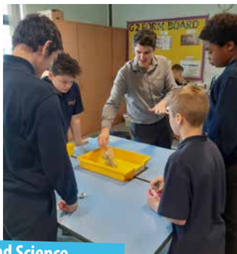
Maths and Science